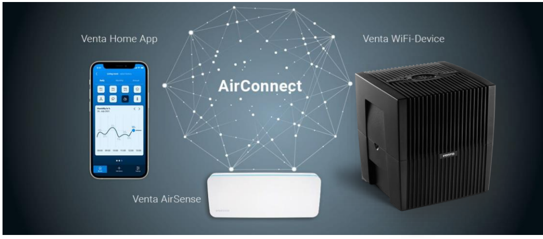
Venta AirConnect: The care package for good indoor air

Inside, all devices of the Original series do their job with the technology of cold evaporation, proven for over 40 years. All Venta Air Humidifiers are based on the principle of cold evaporation, which is the most natural and recognized best method of humidification. It is the same humidification technology used in all high quality Airwasher models.